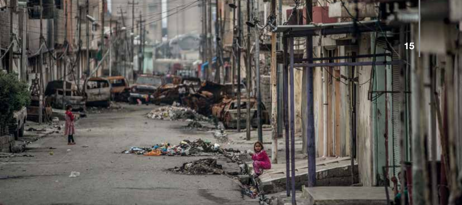
Picture of the Iraqi city of Mosul, destroyed by the war that broke out in 2011.

13. To assess the extension of protection to the family, uniform criteria need to be established to accredit that they are relatives and if applicable their situation of dependence or prior cohabitation. These criteria must be adapted to the socio-cultural reality in the families' countries of origin and residence, as well as to their conditions in terms of security and safety. It is also necessary to establish criteria a priori about cases that will require DNA tests (for nationality, lack of identification documents, lack of documents showing family relationships, etc.) in order to streamline their processing from the beginning.