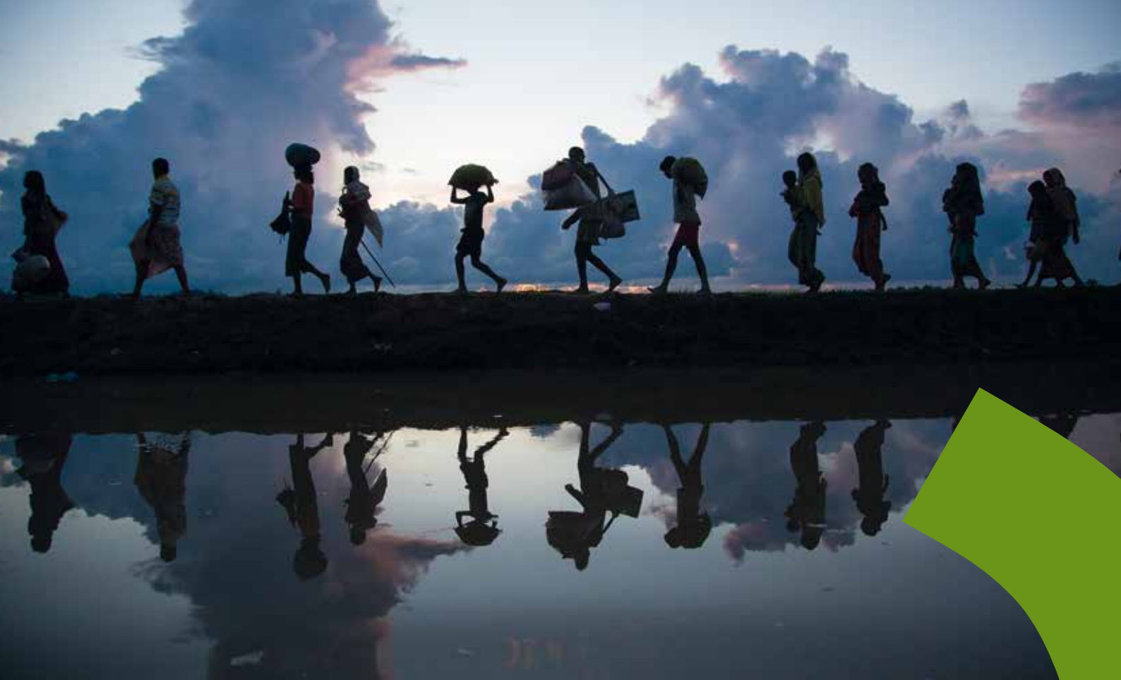
Rohingya refugees crossing the border between Myanmar and Bangladesh on 9th October 2017.

We present our sixteenth Annual Report at a crucial time for the right to asylum and refugees, given that by 30 June 2017 there were over seventy million forcibly displaced people around the world. We are facing the biggest exodus ever known in the history of humanity.