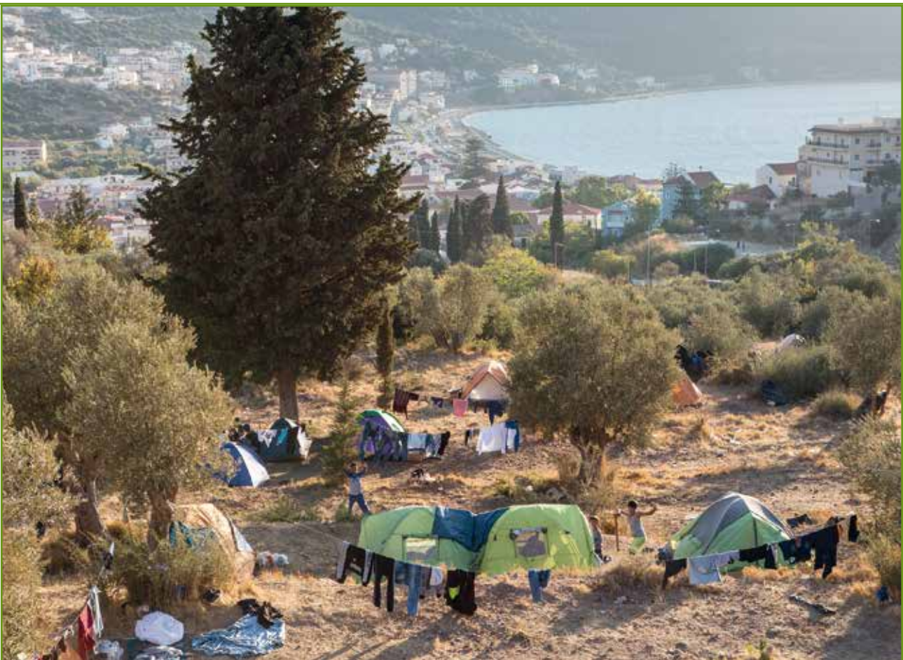
Due to the saturation of the Vathy reception centre on the Greek island of Samos, some families have settled in a nearby olive grove.

The number of people who applied for international protection in the EU (704,625) halved in 2017 compared to 2016 (1,259,265) and 2015 (1,321,600) due to the policy of closing borders. In the wake of the controversial EU-Turkey Agreement of March