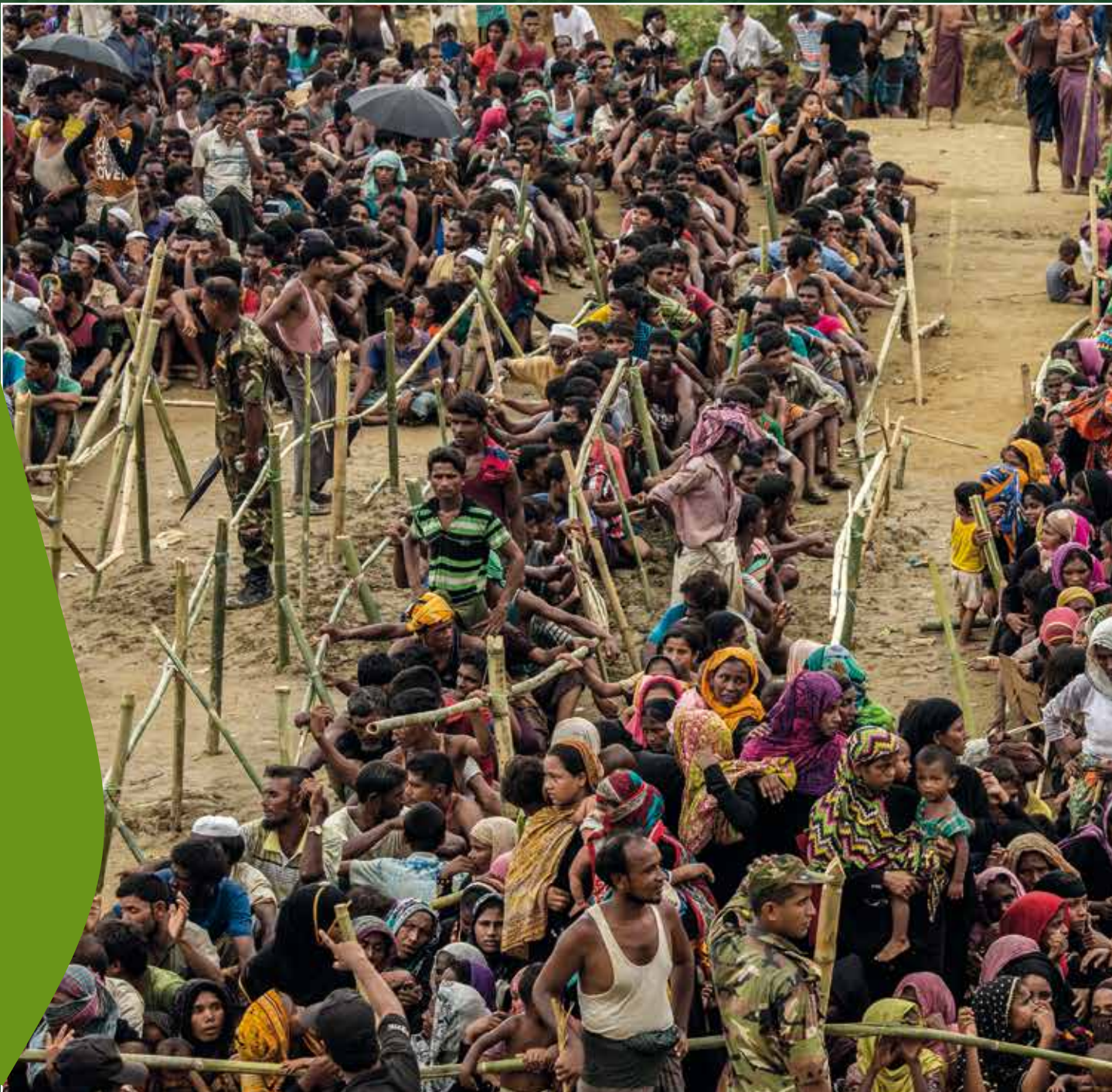
Hundreds of Rohingya refugees queue for food in the Balukhali camp in southern Bangladesh.