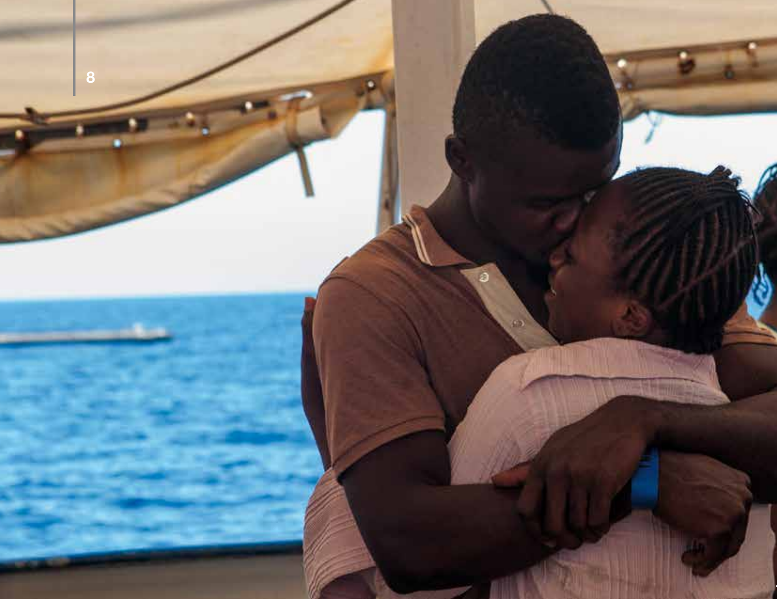
A couple celebrate having been saved in the Mediterranean aboard the Golfo Azzurro, a rescue boat from the Catalan NGO Proactiva Open Arms.

2016, in February 2017 the European Union signed an agreement with Afghanistan to promote the “voluntary” return of refugees, whose Operational Plan remains a protected secret. One month later, the EU Action Plan on Return was announced, which suggested measures for the Member States to speed up the procedures for returns and improve collaboration with the countries of origin for the same purpose.