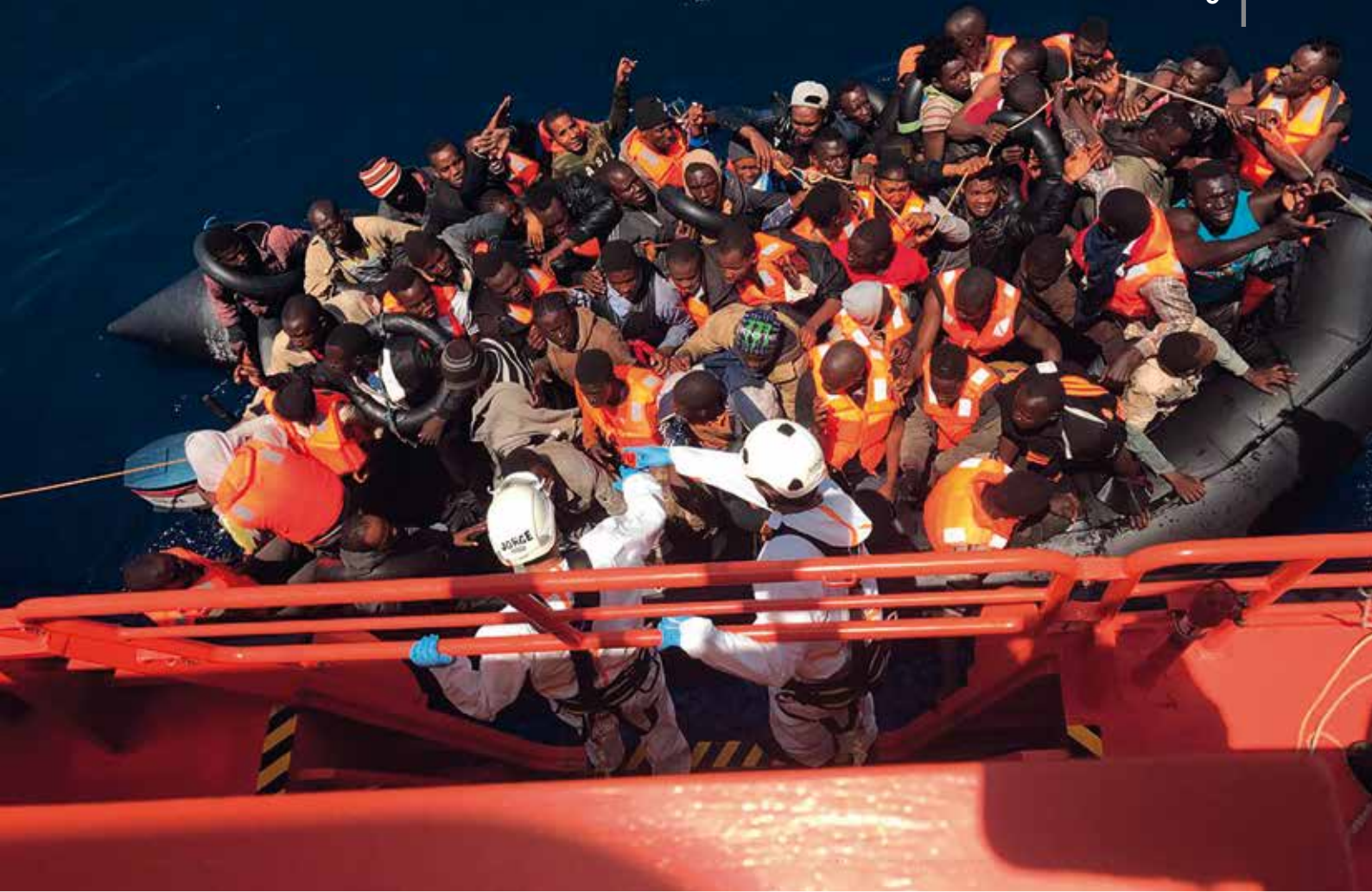
A couple celebrate having been saved in the Mediterranean aboard the Golfo Azzurro, a rescue boat from the Catalan NGO Proactiva Open Arms.