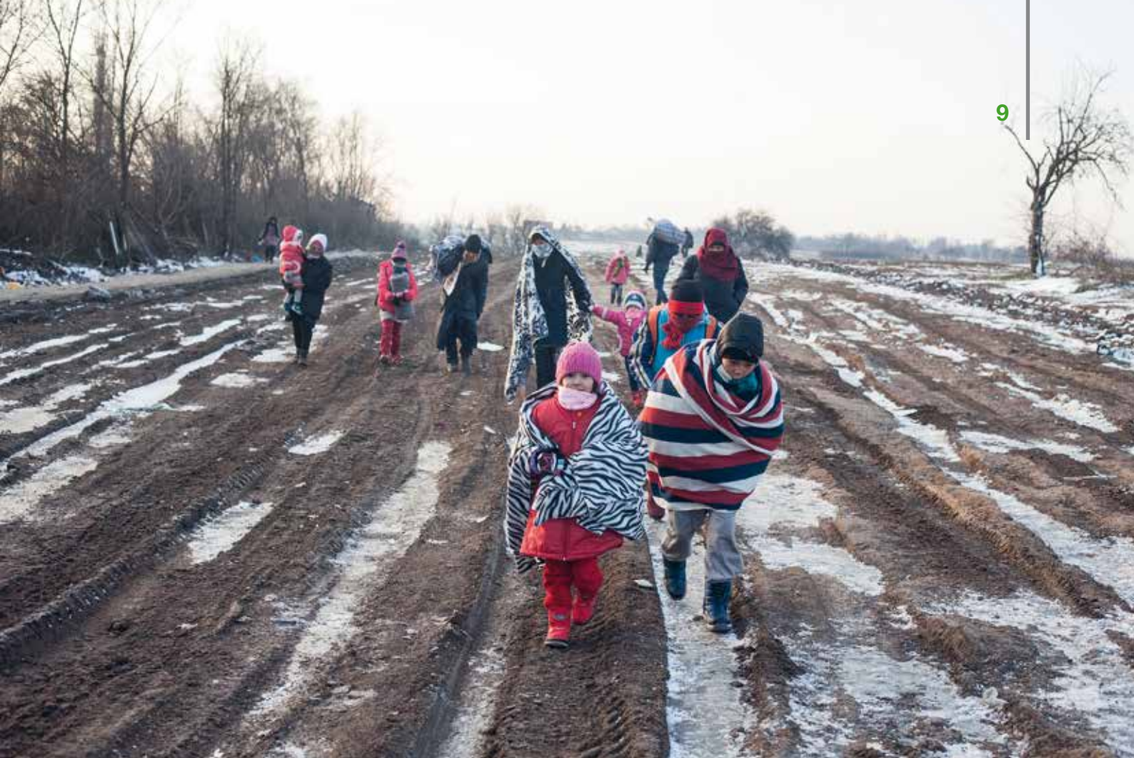
Refugees crossing Macedonia's border with Syria in January 2016.

granted, as well as in the conditions of reception. This situation makes it more difficult to achieve a Common European Asylum System.