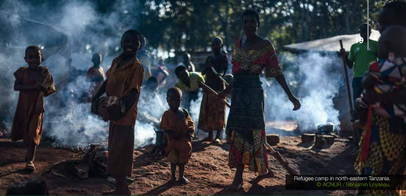
Refugee camp in north-eastern Tanzania.