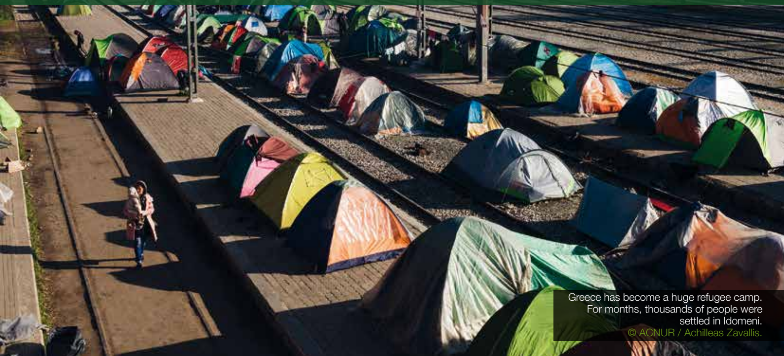
Greece has become a huge refugee camp. For months, thousands of people were settled in Idomeni.

5. The immediate transposition of European directives on asylum and urgent approval of the regulations that apply the rules of the Law of Asylum, which has been pending for nearly seven years.