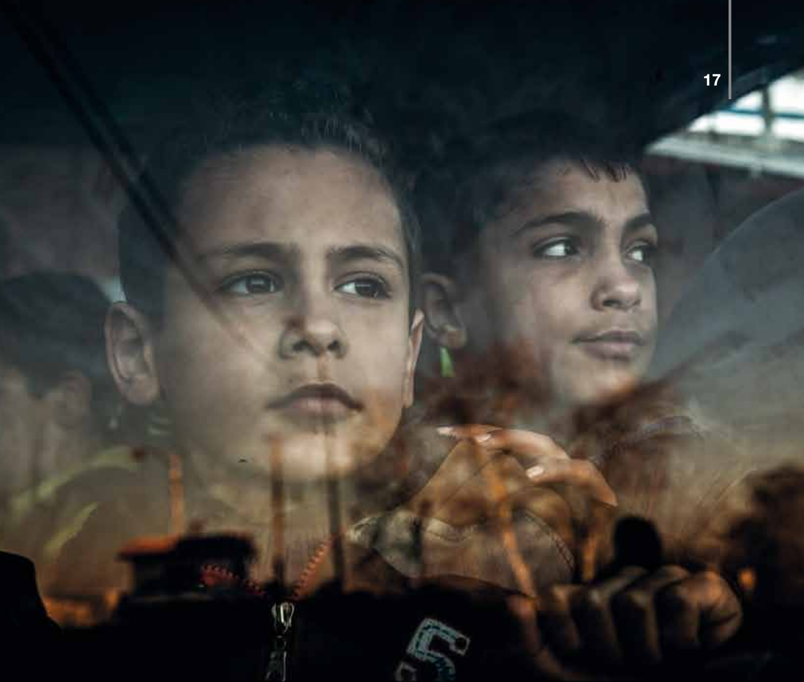
Children in an orphanage in Homs, Syria.