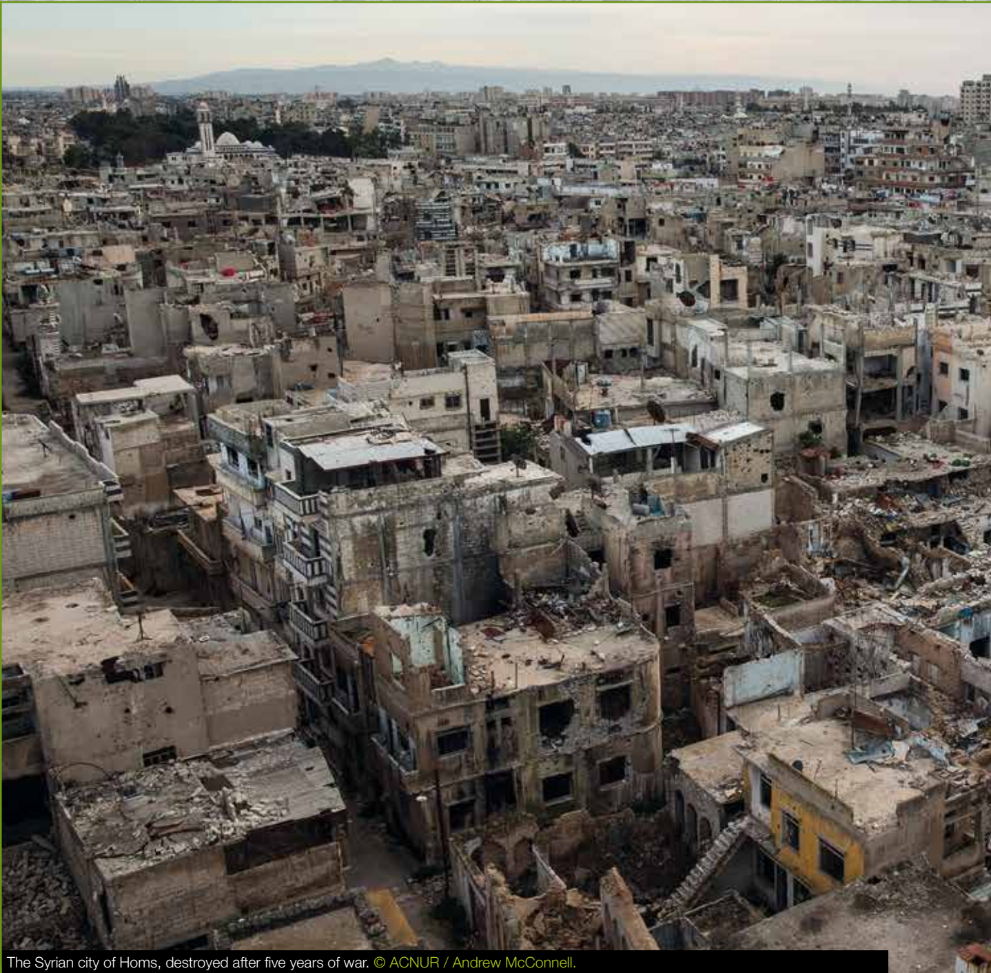
The Syrian city of Homs, destroyed after five years of war.