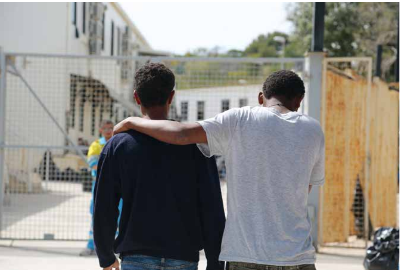
Two African refugees held in the centre of Lampedusa (Italy).

The European Union needs a true, efficient Common European Asylum System inspired by what it recognises as its founding principles. Once again this year, significant differences have been identified in the percentages of international protection