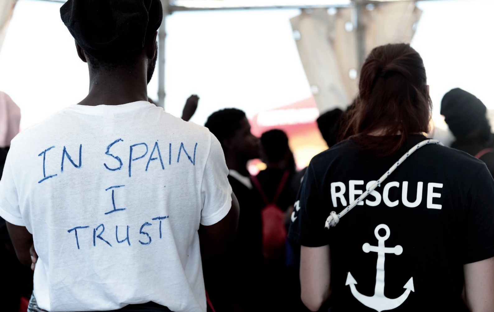
People rescued by the Aquarius disembark in Valencia.

In the current atmosphere of rising anti-immigration discourse, the Government of Spain must provide a clear, firm voice in defence of refugees' and migrants' right to asylum on the European and international level, inspired by the Global Compacts approved by the United Nations in December 2018 and by the agendas for development, climate change and women. This is more necessary and urgent than ever because, according to UNHCR, in June 2018 there were over 70 million forcibly displaced people on the five continents. Syria, South Sudan, Afghanistan, Venezuela, Central America, the Democratic Republic of the Congo and others continue to be the backdrop to armed conflict and serious political and human crises that force many of their inhabitants into exile. [...]