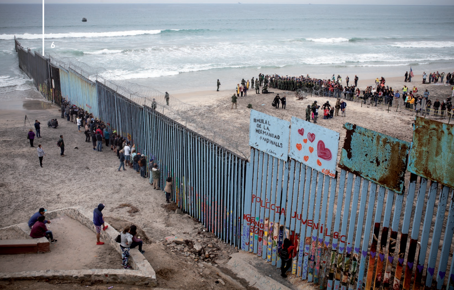
Demonstration by the so-called Central American "Migrant Caravan" on the border between the United States and Mexico, on the beach at Tijuana. 10 December 2018.