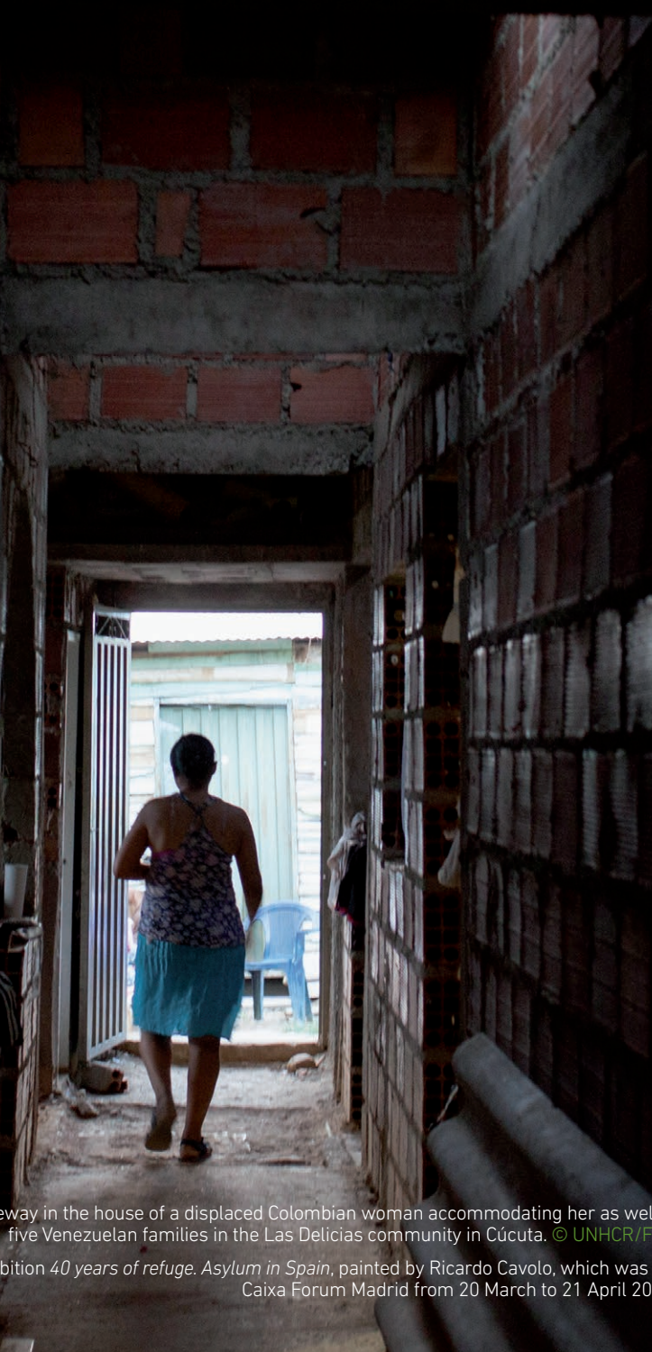
A Venezuelan refugee walks down a passageway in the house of a displaced Colombian woman accommodating her as well as another five Venezuelan families in the Las Delicias community in Cúcuta.