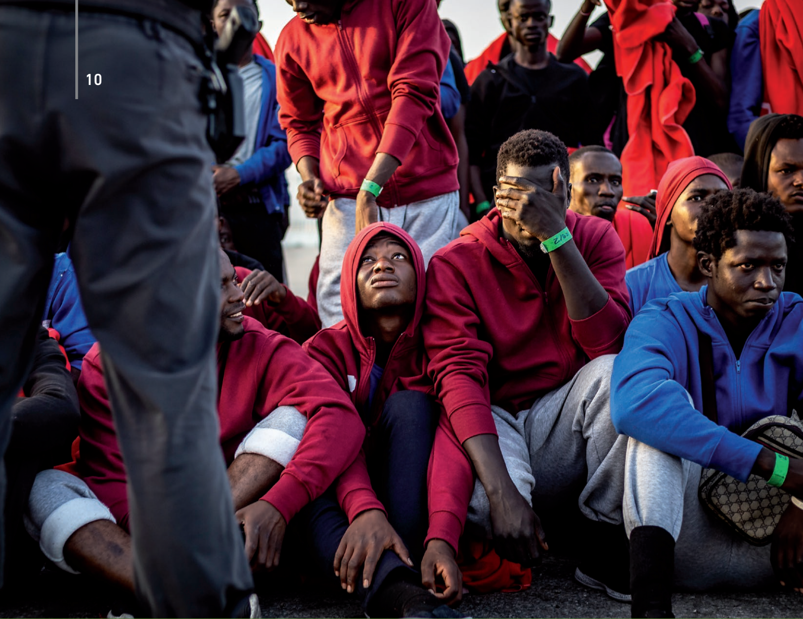
National Police watch over a group of migrants in the port of Algeciras in 2018.