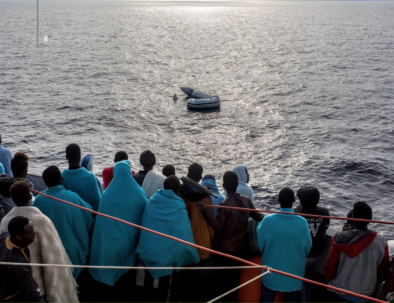
People rescued on 21 December 2018 by Proactiva Open Arms in the Mediterranean watch a half-sunken rubber boat in the Alboran Sea, a day after disembarking in the port of Crinavis, Cádiz. Some of them asked, "Where is everybody?".