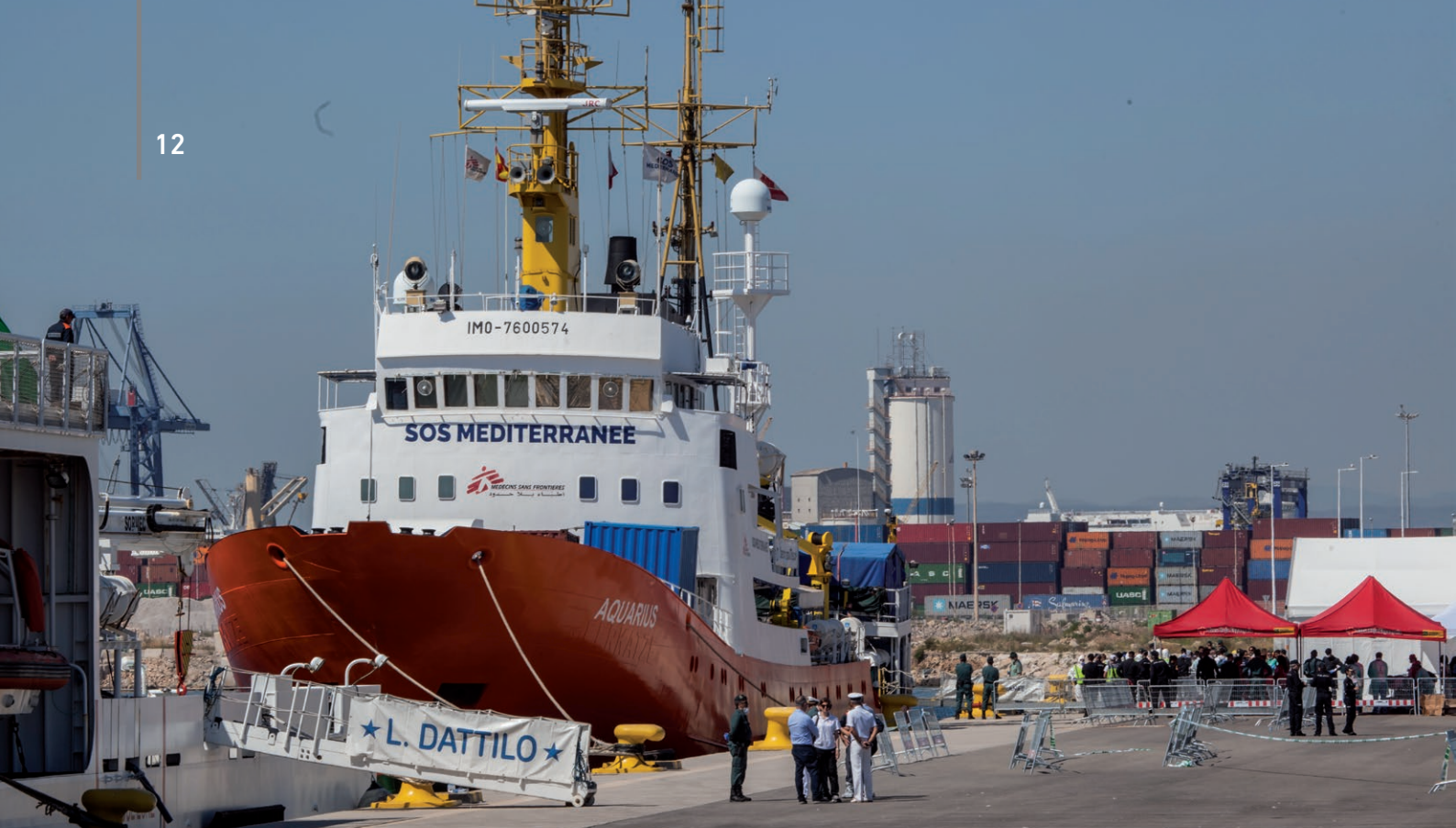
The search and rescue boat Aquarius , operated by SOS Méditerranée in association with Médecins Sans Frontières, on arrival in the port of Valencia on 17 June 2018. After seeing that Italy and Malta closed their ports, the Spanish Government authorised it to disembark in Spain.