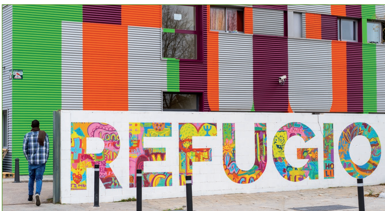
Asylum seeker entering CEAR's Juan José Rodríguez Ugarte Reception Centre in Getafe.

The process of inclusion for international protection applicants into Spanish society is a veritable obstacle course. Among the most complex challenges, there is the need to learn Spanish for people who cannot speak it, which is taught by professionals specialising in this social group, and the importance of recognition for previously acquired education. Then there is their insertion into the job market, which is directly bound to the deadlines and the final decision from the investigation into their international protection application. The alliances with companies that truly take on a social responsibility and show sensitivity regarding these people’s situation are a very useful tool to achieve this goal successfully •