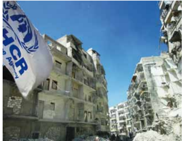
Image of the Syrian city of Aleppo, destroyed after three years of civil war.

13. The Government must increase its commitment to the annual resettling quotas of refugees and assume much greater responsibility for the humanitarian crises such as the one Syria is currently suffering. Spain is at the bottom of the list of European countries that from the beginning of the conflict have approved resettling quotas for refugees fleeing this conflict.