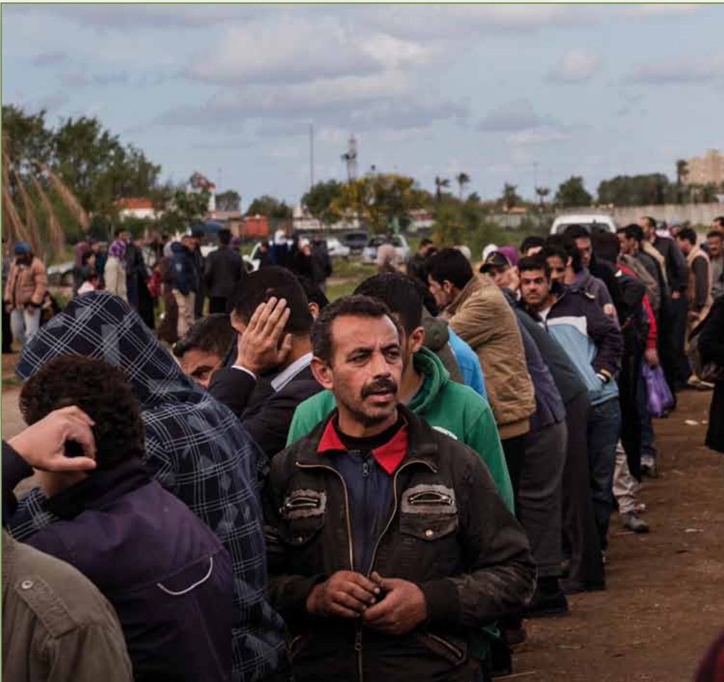
Syrian refugees registered by UNHCR in Tripoli.