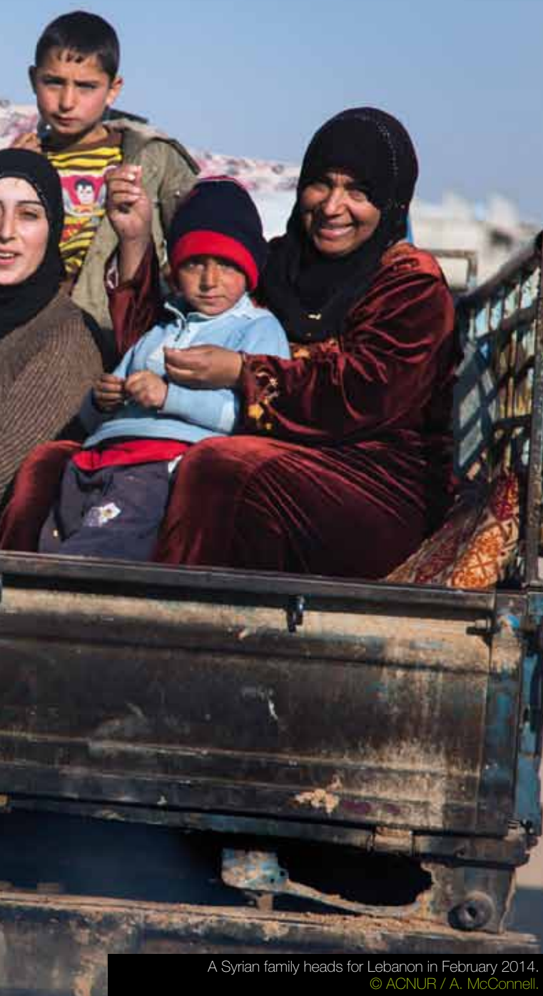
A Syrian family heads for Lebanon in February 2014.

It is very striking to see that, of the international protection resolutions signed by the Minister of the Interior in 2013, 152 dealt with persons from Syria and only obtained refugee status, in a very restrictive conception of the figure contemplated in the 1951 Geneva Convention. Of the remainder, 146 achieved subsidiary protection. It is also surprising to see the almost absolute denial of international protection to persons from countries such as Algeria, Cameroon, Nigeria or Cote d'Ivoire. In 2013, in general the compliance of the courts in assessing the resolutions of the Minister of the Interior regarding the granting of refugee status was maintained, in contrast with the progress which was made in European jurisprudence.