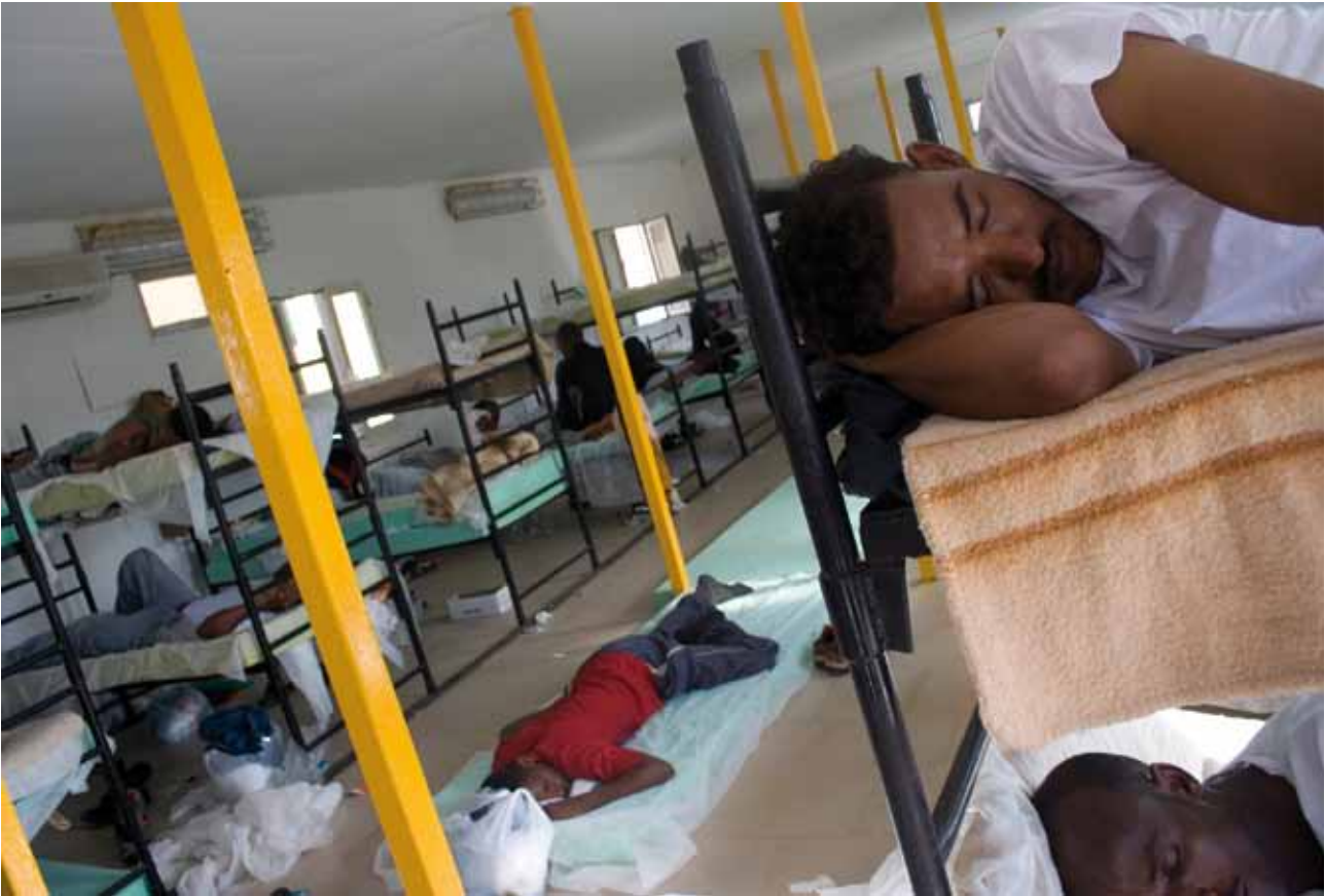
Image of the previous detention centre for refugees and migrants on the Italian island of Lampedusa.