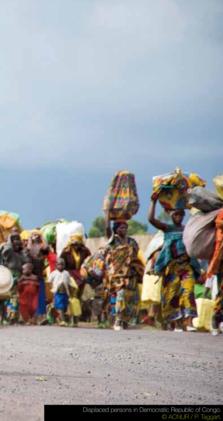
Displaced persons in Democratic Republic of Congo.

be “prudent and restrictive in its application” of this option due to the grave consequences it could have on the concerned party.